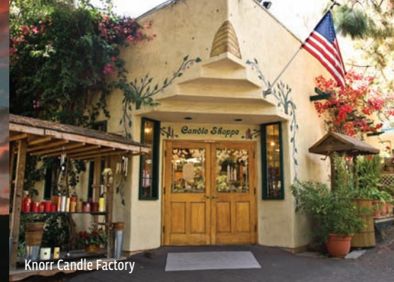
Knorr Candle Factory