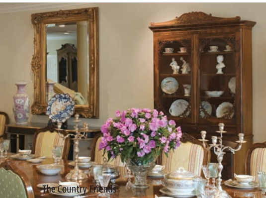
The Country Friends