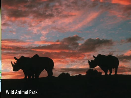
Wild Animal Park