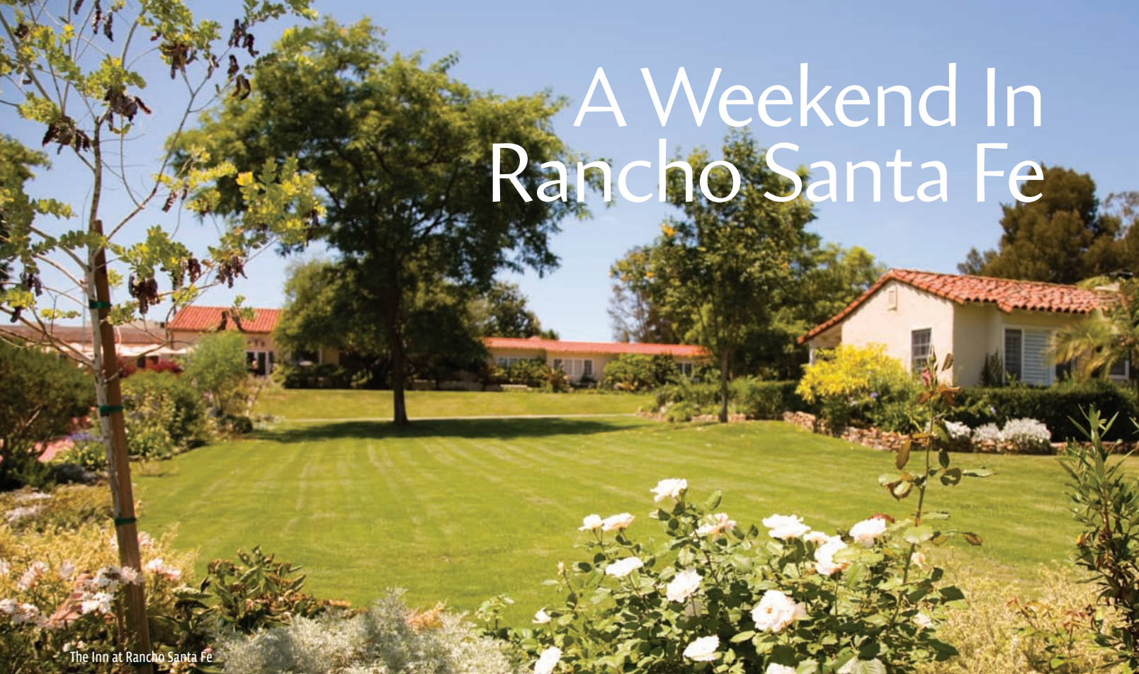
The Inn at Rancho Santa Fe

Continuing on our weekend adventures in S.D.'s cherished neighborhoods, we head to Rancho Santa Fe to explore a community rich in both history and amenities.