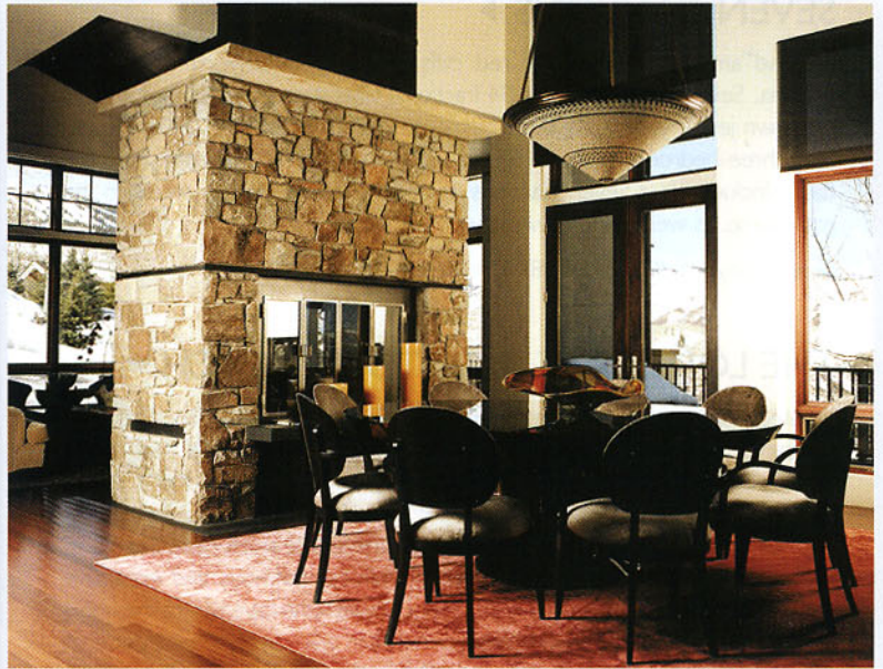
COUNTER CLOCKWISE FROM TOP RIGHT